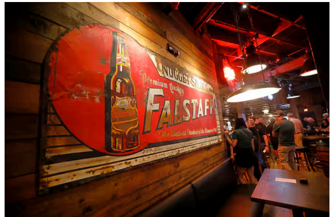
Lucky Dog Saloon opened in a nearly 100-year-old building on Dallas' Cedar Springs Road.

Lucky Dog Saloon is at 2701 Cedar Springs Road, Dallas.