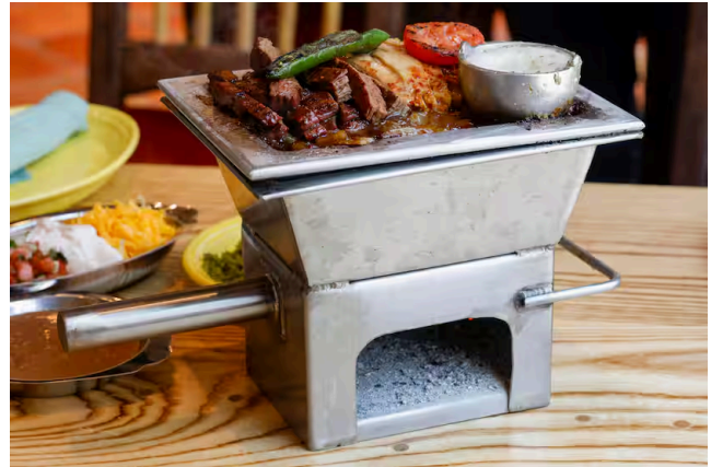
Fajitas at El Tiempo Cantina in Arlington are served in an anafre, or a hot, portable oven.

Ask someone from Houston about El Tiempo Cantina: It's beloved . Part of the reason for that is because the family behind it founded Ninfa's, one of Texas' best-known fajitas restaurants. On July 1, 2024, El Tiempo opened in the Texas Rangers' former ballpark, a venue now called Choctaw Stadium that's across the street from the newer baseball diamond. Fajitas and margaritas are the thing to get here. Put it on your list next time you're in Arlington for a sporting event.