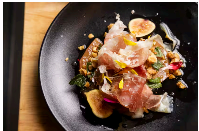
Prosciutto e melone at Radici is plated beautifully.