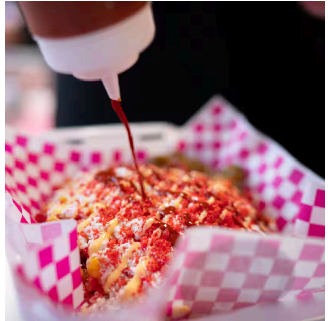
Jesus Perez prepares a "loaded elote tray" at Me Enloteces in Oak Cliff.