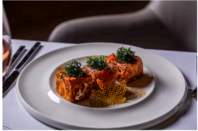
Sanjh is a high-end restaurant. Children under 10 years old are allowed in the dining room on Saturdays and Sundays only.