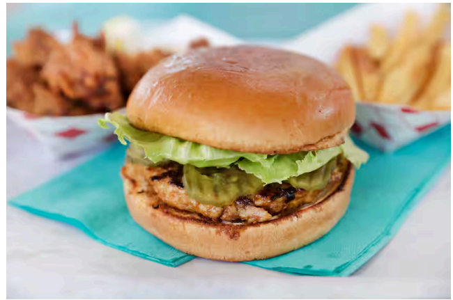
Ookuma's teriyaki burger is served with chicken karaage (back left) and sumo fries (right).