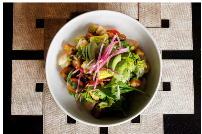
For those who want a lighter lunch instead of burgers, Dee's Table also sells this Big Easy Salad with chilled shrimp.

Dee's Table Burgers & More is at 3685 The Star Blvd., Frisco.