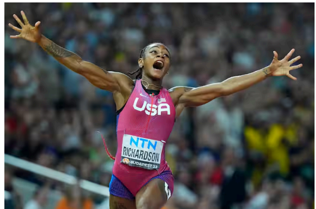
Sha'Carri Richardson celebrates after winning the gold medal in the final of the women's 100-meters during the World Athletics Championships in Hungary in 2023.

Blackjack Pizza is at 2536 Martin Luther King Jr. Blvd., Dallas.