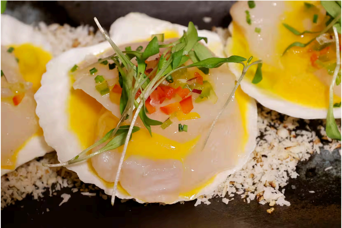
Light fish dishes are on the menu at Mar y Sol, a Latin restaurant on Dallas' McKinney Avenue. It opened in place of the longtime Abacus. Mar y Sol is one of 11 restaurants to visit now in North Texas.